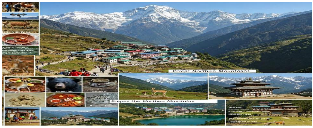
Note – All the activities to be done on A4 sheets (unless specified)